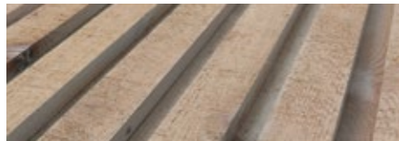
COLOUR: MIST COLOUR CODE: M