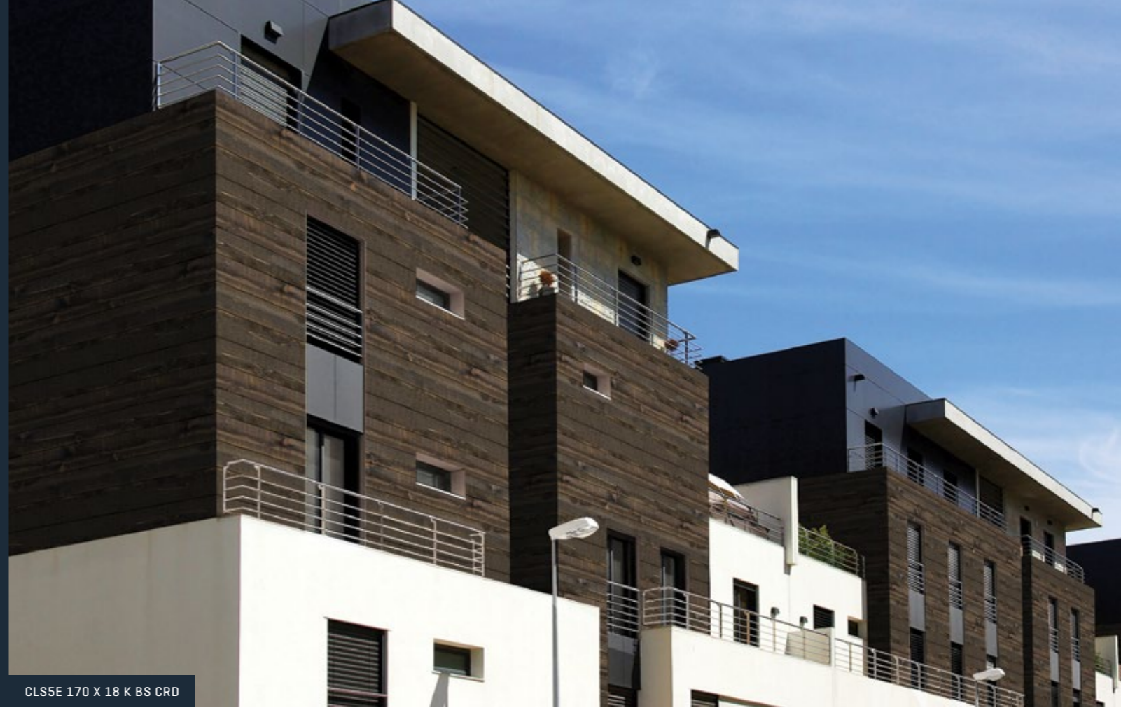
CLS5E 170 X 18 K BS CRD