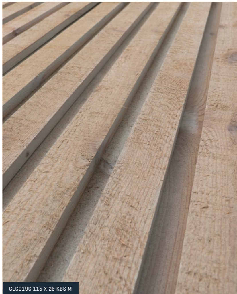
CLCG19C 115 X 26 KBS M